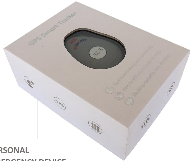
PERSONAL EMERGENCY DEVICE & BOX